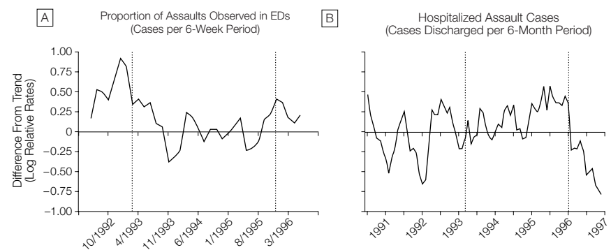
Figure 2. Proportion of Assaults Observed in Emergency Departments (EDs) and Hospitalized Assault Cases

To delineate the effects of the interventions from historical time trends, A and B present detrended differences between intervention and matched comparison sites over time. The left dotted line is the point of initiation of the first intervention and the right dotted line is the point at which all interventions were active in all intervention sites. Values in A are from 1 experimental and 1 comparison site. Values in B are from January and July in each year starting with July 1990 and are from 2 experimental and 2 comparison sites.